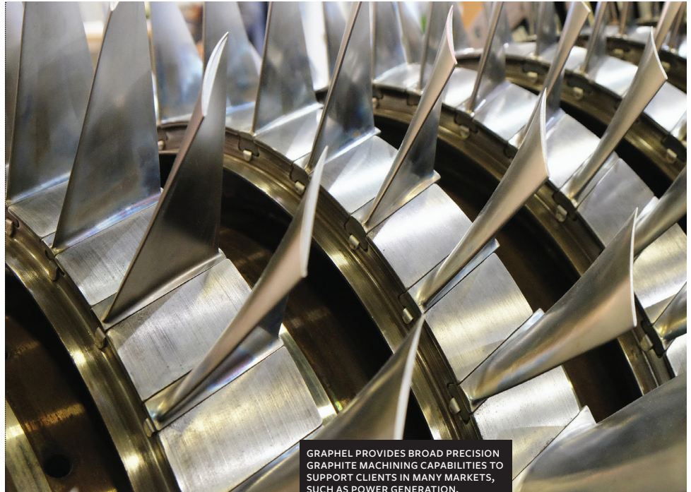
GRAPHTEL PROVIDES BROAD PRECISION GRAPHITE MACHINING CAPABILITIES TO SUPPORT CLIENTS IN MANY MARKETS, SUCH AS POWER GENERATION.

"I couldn't be prouder of the team Graphel has assembled at all of our locations and at all levels," Trinkley says. "We are very fortunate to have the team and ownership that we have. The people here bring a vibrancy and are always up for the challenge to change for any market condition or customer need. It's amazing to watch what our people can do." mt