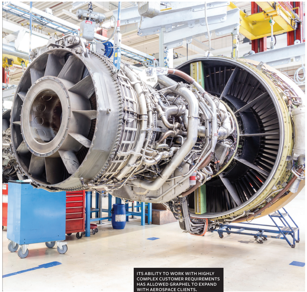
ITS ABILITY TO WORK WITH HIGHLY COMPLEX CUSTOMER REQUIREMENTS HAS ALLOWED GRAPHTEL TO EXPAND WITH AEROSPACE CLIENTS.